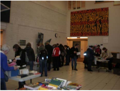
Browsers occupy Fine Arts lobby

Our book sale fundraiser, held on November 19th in the lobby of the Fine Arts building on UVic's campus, was a great success. We raised over $1000 in sales and donations.